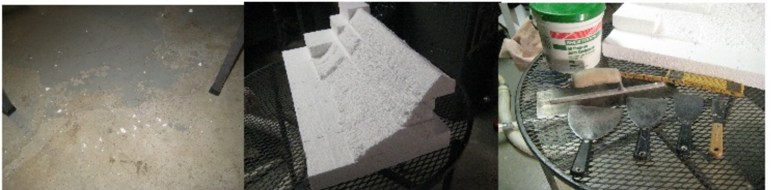
15. Texturing tools & supplies