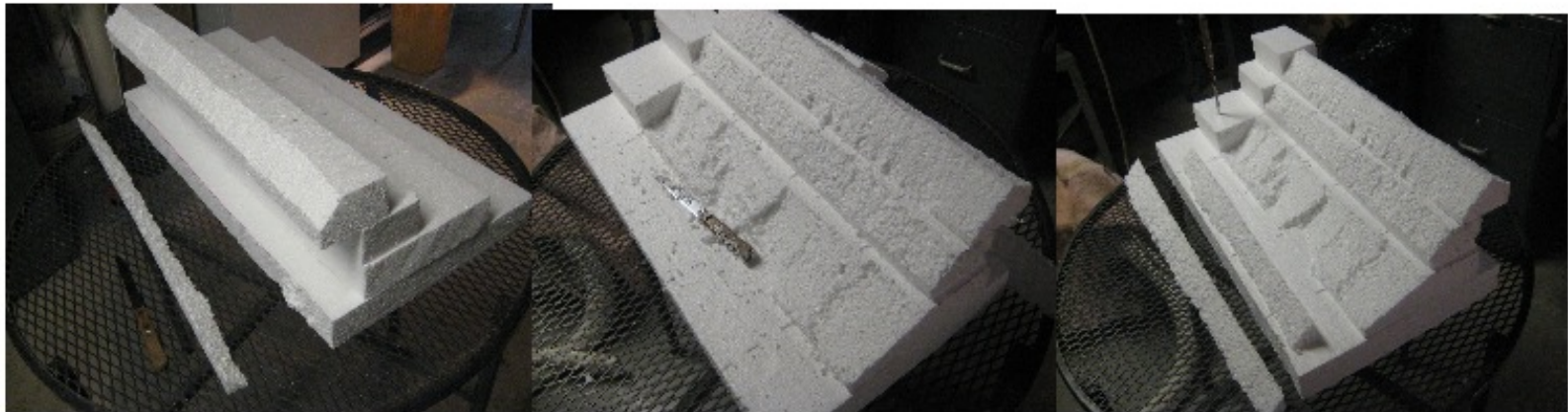
10. Repair any cutting mishaps