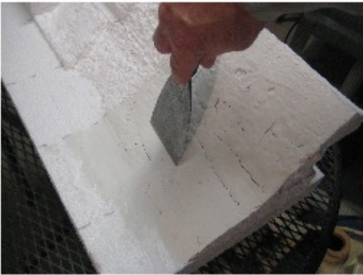
16. Apply joint compound